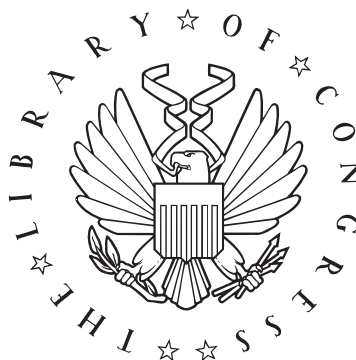
Carla Hayden Librarian of Congress

A handwritten signature in black ink that reads "Carla Hayden". The signature is fluid and cursive.