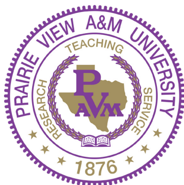
Ruth J. Simmons President Office

A handwritten signature in black ink that reads "Ruth J. Simmons". The signature is fluid and cursive.